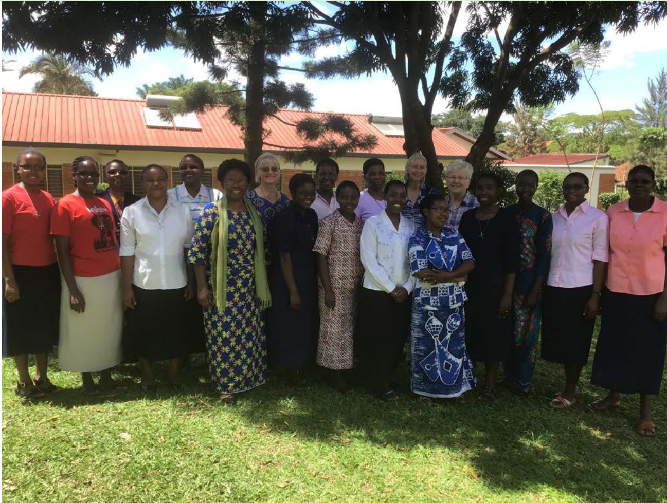
Image, retreat MMS, Kampala 2019